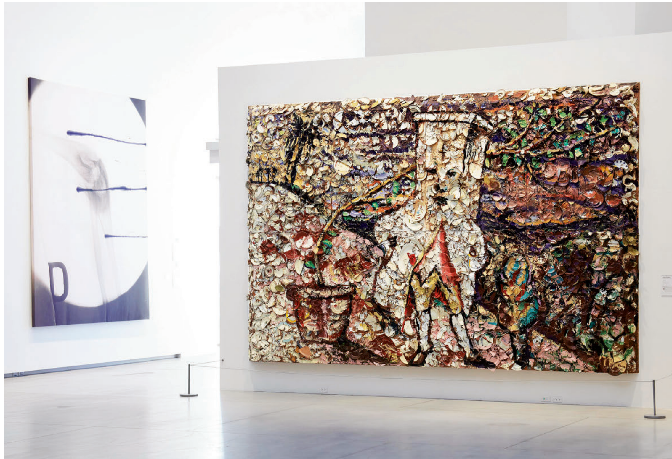
Left, Untitled (X-Ray), 2008, ink on polyester, approx. 12½ by 9½ feet; right, Australia, 1986, oil, plates and Bondo on wood, 11 by 17 feet.