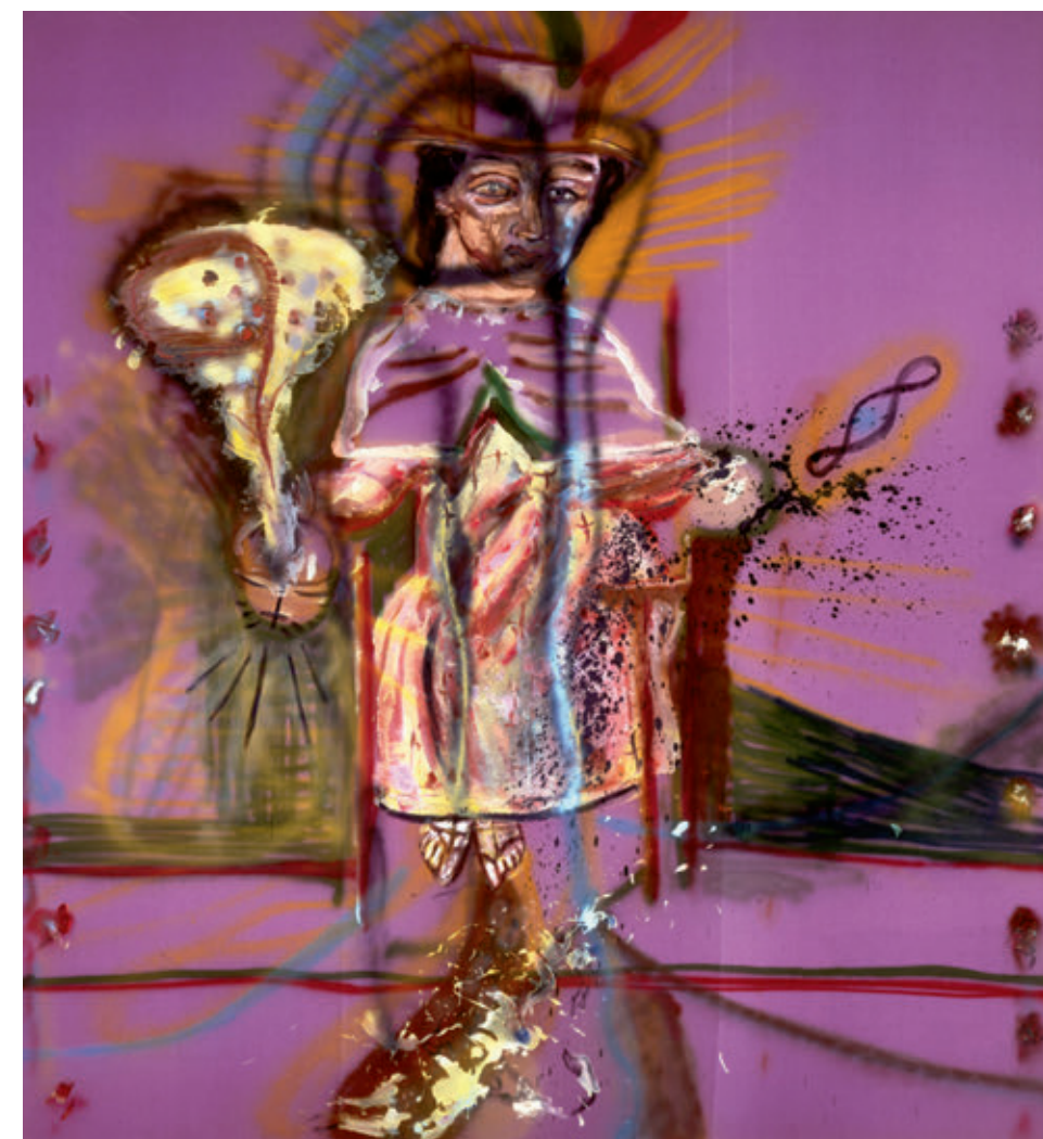
Right, Resurrection: Albert Finney Meets Malcolm Lowry , 1984, oil, spray paint and modeling paste on velvet, 10 by 9 feet.

Recognizing El Niño de Atocha in Resurrection: Albert Finney Meets Malcolm Lowry , and recalling the devotional imagery that runs through Schnabel's entire oeuvre, I began thinking in a new way about the floating torsos and other fragmentary images in his early encaustic paintings such as Accattone (1978) and Procession (for Jean Vigo) , 1979, the severed heart in The Afflicted Organ (1987) and the odd objects—such as Moroccan horse bridles—attached to some recent paintings. They began looking a lot like milagros , the votive offerings left on church altars and holy shrines throughout Mexico. A milagro (the word means miracle or surprise in Spanish) can be given in thanks for an answered prayer or as