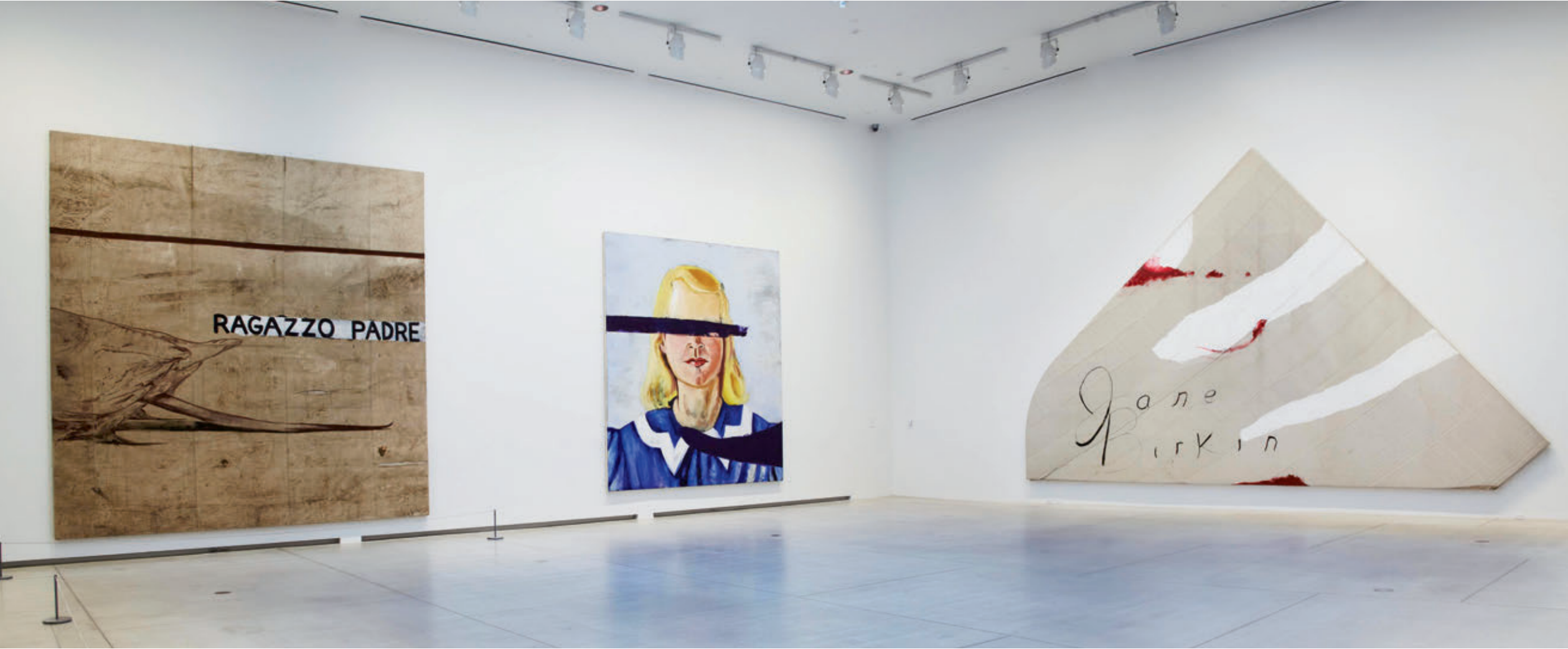
Left to right, Ragazzo Padre, 1988, oil and gesso on tarpaulin, 16 feet square; Large Girl with No Eyes, 2001, oil and wax on canvas, approx. 13½ by 12½ feet; Jane Birkin #2, 1990, oil and gesso on sailcloth, 16 by 26 feet.

LIKE OTHER VIEWERS, I HAVE PONDERED THE INSCRIPTIONS THAT ERUPT ACROSS SO MANY OF SCHNABEL'S PAINTINGS, AND BEEN, BY TURNS, PUZZLED, INTRIGUED, ENLIGHTENED AND FRUSTRATED BY THEM.