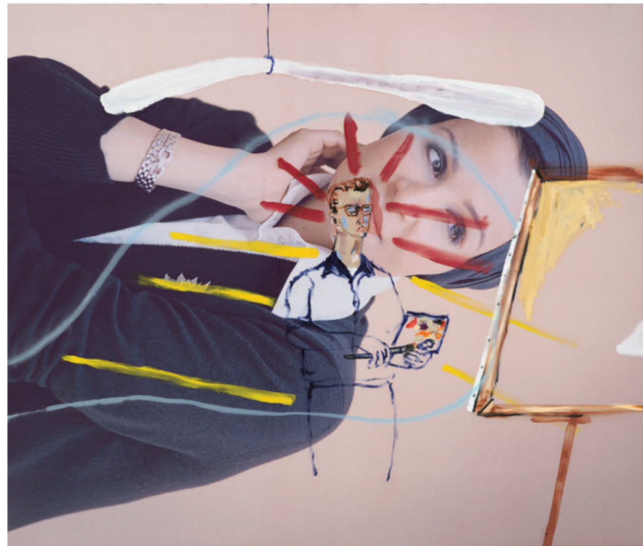
Opposite, Sheikha Mozah , 2010, oil on polyester, approx. 9½ by 11½ feet.

Another is the emphasis on feeling in their work. A third is their belief in the redemptive power of art. In his willingness to improvise, in his bold emotionalism, and in his underlying religiosity, Schnabel has carried on these tenets. He may be the only well-known painter of his generation to have done so. I suspect that Schnabel's insistence on what many dismiss as the romantic side of Abstract Expressionism partly accounts for his marginalization; he's like the inconvenient relative who reminds us of a piece of embarrassing family history.